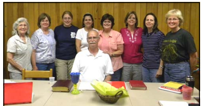
The 2010 Graduating Class of Disciple One