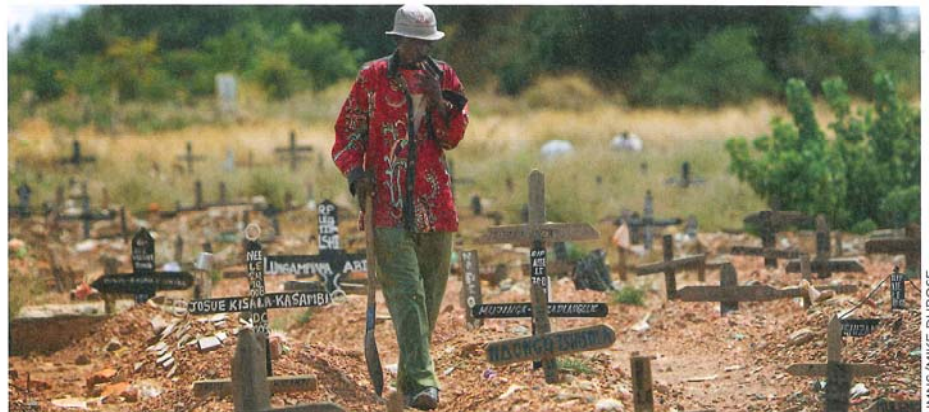
A gravedigger walks among dozens of fresh graves in the children's section of the Penga Penga Cemetery in Lubumbashi, Democratic Republic of Congo. Four of five children in the city of 3 million die before age 5 due to malaria.

There are one billion living in these conditions today. The Bottom Billion [Cokesbury,